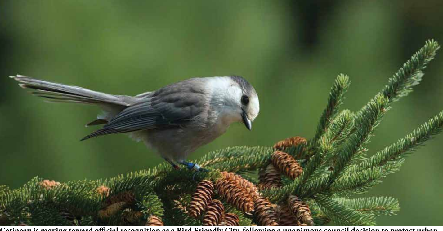
Gatineau is moving toward official recognition as a Bird Friendly City, following a unanimous council decision to protect urban bird habitats, raise public awareness, and strengthen biodiversity across the municipality. (TF)

Still, many species are under threat. Birds once common in the region—