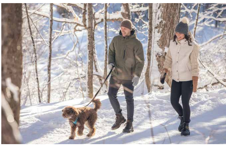
However, on four trails pets From December 1 to April 14 leashed dogs are allowed on the Sugarbush are permanently prohibited due Trail, Lauriault Trail, Pioneers Trail, and Capital Pathway.

During the winter season leashed dog access is