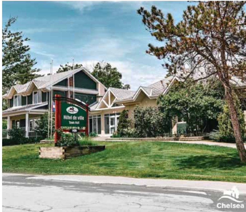
Chelsea is inviting residents to help choose an official name for its population through public consultation, as part of its 150th anniversary celebrations. (TF)

the character of Chelsea, while being respectful of both official languages and inclusive in gender expression and must align with the toponymic standards of Québec. To guide the creative process, residents might look to examples such as Chelseans, Chelseaites, or Chelsoniens, while also exploring more imaginative or locally meaningful options that reflect the town's bilingualism and cultural landscape. Ultimately, the chosen name should feel authentic to Chelsea's identity and resonate with both newer arrivals and long-established families.