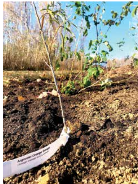
Arbre-Évolution has launched a digital platform to amalgamate the environmental and social impacts of over 300 ecological restoration projects across the province, including two in the Outaouais region, highlighting nearly a decade of work in reforesting communities and mitigating climate impacts. (TF)

In 2019, Arbre-Évolution collaborated with the municipality of L'Ange-Gardien to reforest a riparian zone along the Lièvre River, planting over 650 trees and shrubs to stabilize the riverbank, boost biodiversity, and create a publicly accessible green space. That same year, the cooperative partnered with Groupe ABS in Val-des-Monts to help the company offset its transport-related carbon emissions by planting trees across multiple sites.