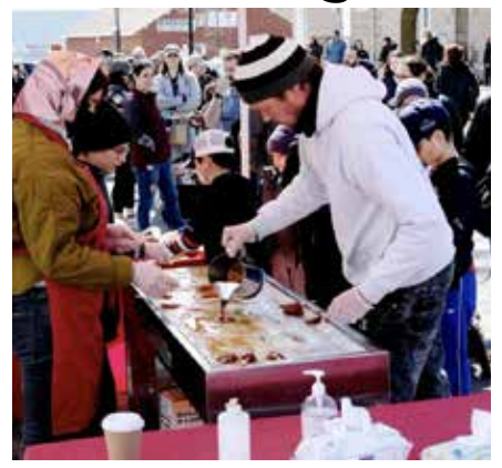
Vieux-Aylmer se sucre le bec, from April 9, 2024. (TF)

Val-des-Monts invites visitors to Sucrerie du Terroir, an authentic maple